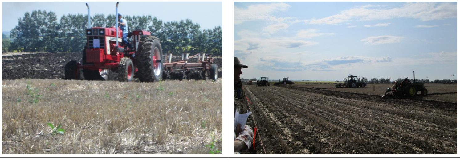
A 1568 International with a V8 engine makes short order of the plowing area.

On July 18, 19, & 20<sup>th</sup>, 2013 the LWAS greeted visitors from all over the world at their display at the Olds College 100<sup>th</sup> Anniversary celebration in conjunction with the World Plowing Championship. We were open from 8:00 a.m. until 6:00 p.m. each day in the vintage display tent city. Many visitors enjoyed the artifacts that were on display and reminisced about their use.